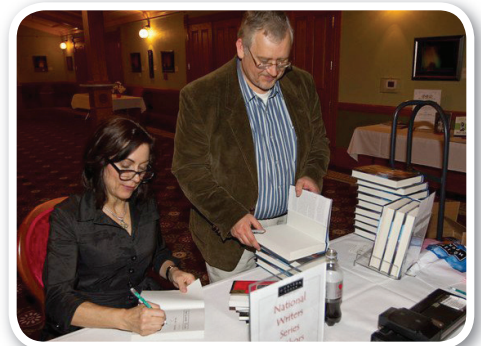
Mary Karr signing books after NWS event