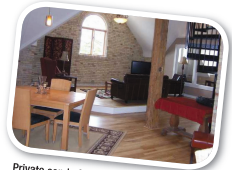
Private condo for authors

OUR MOTTO IS Great Stories, Great Conversations. NWS provides an enriching, entertaining experience for visiting writers. From event planning details with agents and publicists, to travel arrangements, meals and housing – you’ll find that our team ensures an amazing visit. Each writer’s special requests are facilitated. NWS guests are housed in complimentary private condominiums located in a beautifully redeveloped 19th century estate in downtown Traverse City surrounded by lovely old trees, boutiques, wine tasting rooms, and exquisite dining.